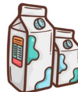
Milk, Juice or Soup Cartons